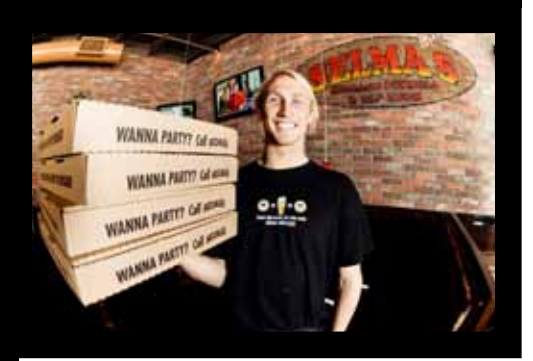
Selma's loves to party!